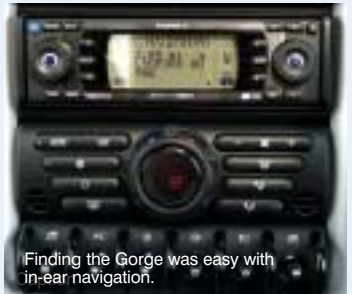
Finding the Gorge was easy with in-car navigation.